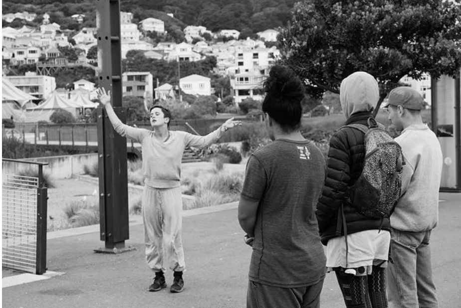
closer , New Zealand, 2016.

he had performed the first time, but also introducing new ideas, such as a wonderful falling to the floor and rotating in a more squarelike pattern instead of in the circles of his first solo. He moved more often in and out, behind and through the spaces between the audience members sitting around him. “Yes,” the other dancers remarked. “Yes.” “Yes.” “Yes.”